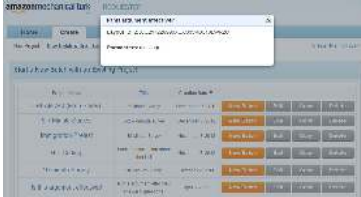
Figure 2: Retrieving a HIT LayoutId from the RUI

left-hand side of the screen. A pop-up window will appear displaying the LayoutId and the name of any placeholders (see Figure 2). Those placeholders can be replaced with the relevant material when CreateHIT() is called, by specifying hitlayoutid and hitlayoutparameters . Assuming the newspaper texts are loaded into R in a list of character strings called articles , one can simply iterate through that list to create each HIT, placing the text of each article in the message layout parameter: